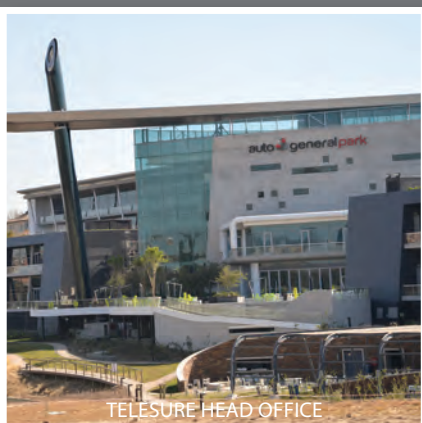
TELESURE HEAD OFFICE

The ability to quickly and efficiently respond to changes in the environment, tenant turnover and a high churn environment where changes are cost minimal reducing labor costs, the use of additional materials resulting in energy, time and labor costs savings, while improving occupancy health comfort and productivity. These access floors systems are designed for general office areas, network and patch rooms, data and call centres, casinos and large scale banking environments.