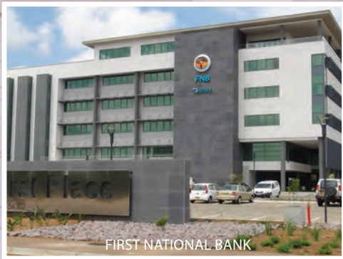
FIRST NATIONAL BANK